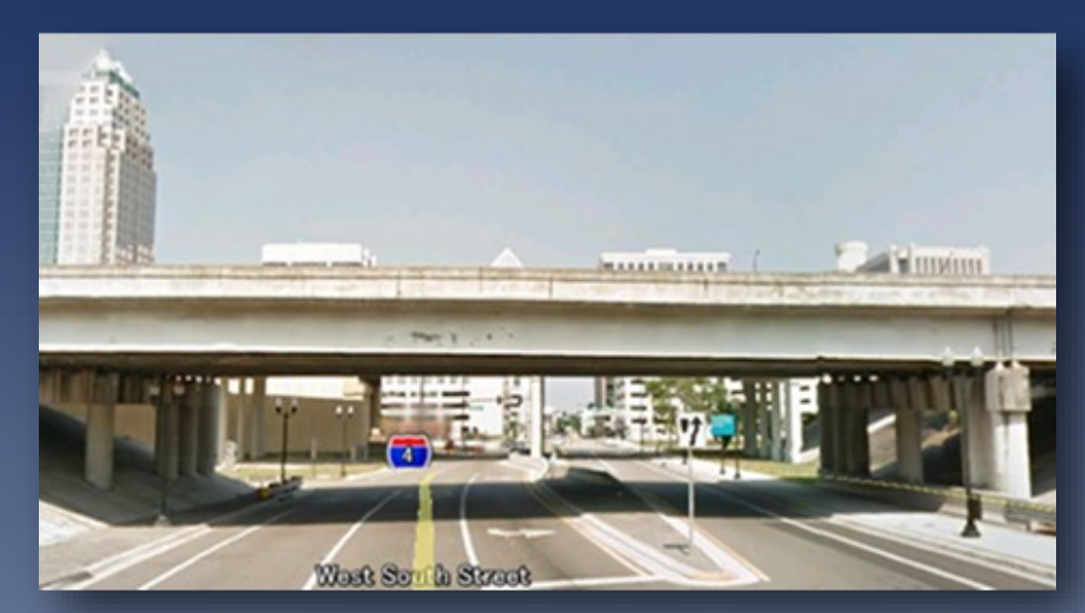
A scanned bridge in downtown Orlando, FL

NEXCO - West USA 8300 Boone Blvd. Suite 260 Vienna, VA 22182