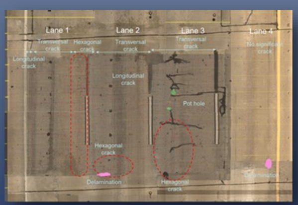
Overall condition of the deck at downtown

NEXCO's inspection pinpointed major and minor spalls, delamination, unsound patches, pattern cracking, and moderate to severe cracks. This demonstration proves the effectiveness of DTSS over traditional methods such as chain dragging.